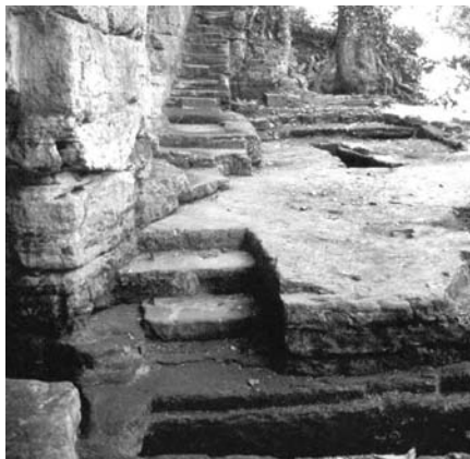
St Roberts Cave, Knaresborough (26619)