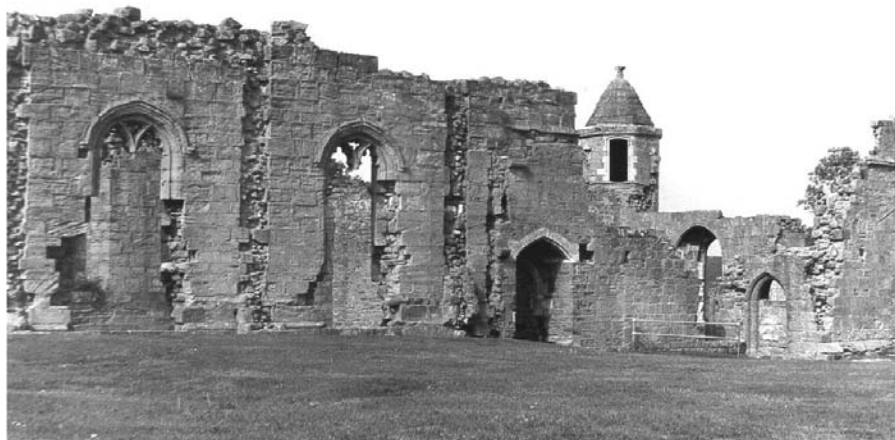
Spofforth Castle (13273)