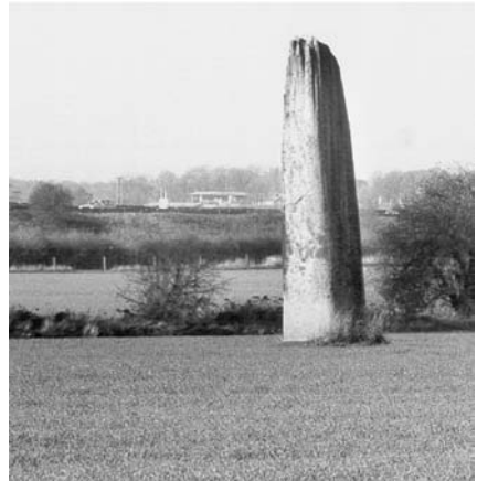
One of the Devil's Arrows, Boroughbridge (28221)