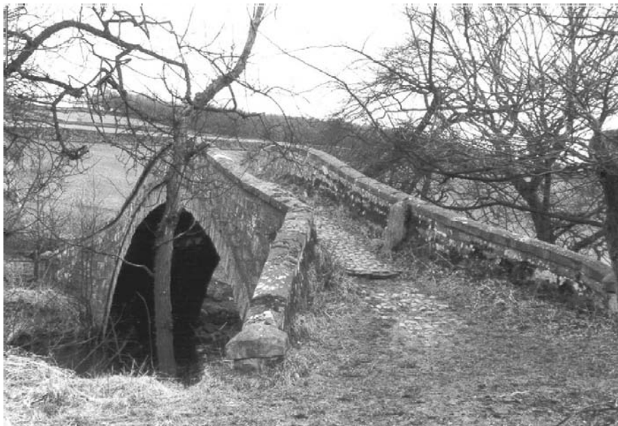
New Bridge, Birstwith (138)