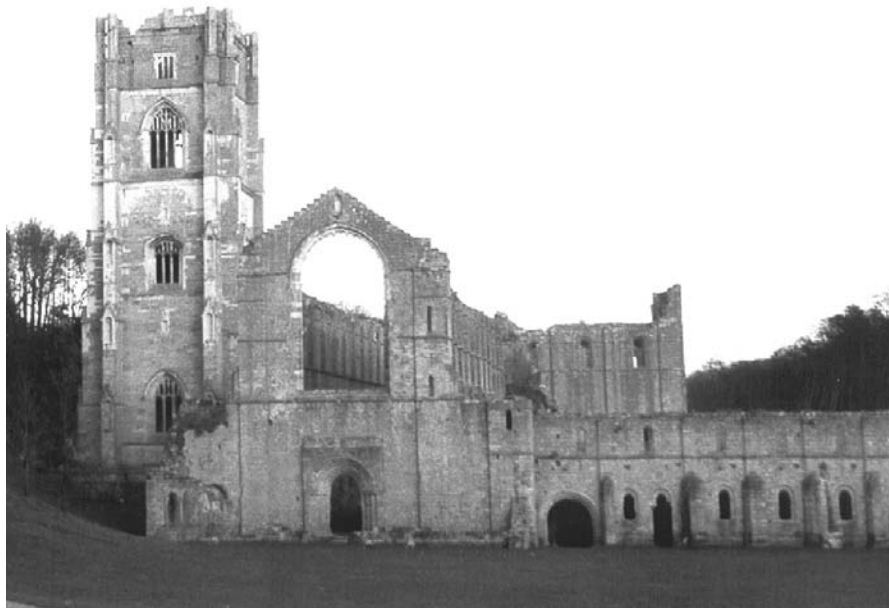
Fountains Abbey (26930)

It should be noted that, unlike the case with listed buildings, local authorities have no powers to require emergency repairs or compulsorily to acquire ancient monuments.