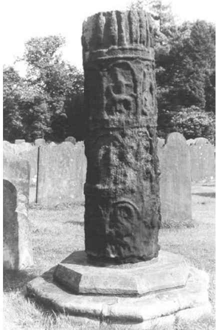
Saxon cross shaft in St Mary's churchyard, Masham (26943)

An ancient monument is defined by the Ancient Monuments and Archaeological Areas Act 1979 as any structure, remains of a structure, or site of a structure, above or below ground, which the Secretary of State for Culture, Media and Sport considers to be of public interest by reason of its historic, architectural, traditional, artistic or archaeological importance. Each County and Unitary