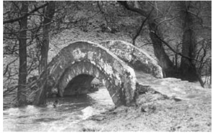
Thornthwaite packhorse bridge (214)

28073 Rock with one cup mark E of the plantation on Weston Moor 380m NW of Weston Moor Cottage SE18724947