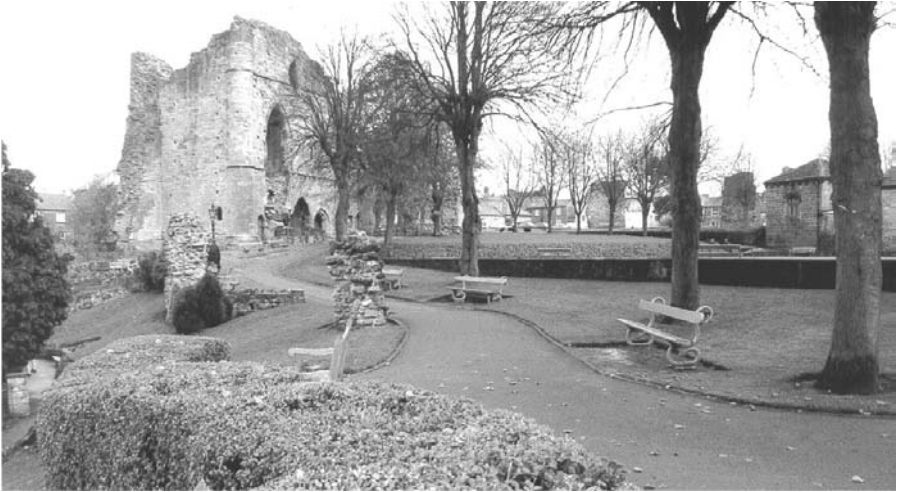
Knaresborough Castle (481)

Archaeological remains should be seen as a finite, and non-renewable resource, in many cases highly fragile and vulnerable to damage and destruction. Appropriate management is therefore essential to ensure that they survive in good condition. In particular, care must be taken to ensure that archaeological remains are not needlessly or thoughtlessly destroyed. They can contain irreplaceable information about our past and the potential for an increase in future knowledge. They are part of our sense of national identity and are valuable both for their own sake and for their role in education, leisure and tourism.