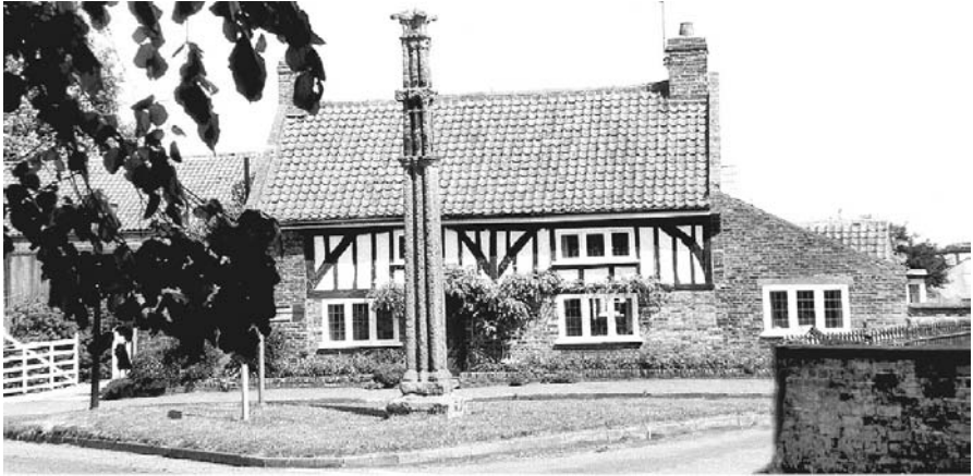
Aldborough Cross (262), near Boroughbridge.

'desktop' assessment of whether the site is known, or likely, to contain archaeological remains. If the site appears to be archaeologically sensitive, a fuller investigation may be required. This will normally involve a non-destructive ground survey and, occasionally, ground trenching. Where it is proposed to grant permission for a development which would result in the destruction of archaeological remains, the local planning authority should satisfy itself, before granting permission, that the developer has made appropriate and satisfactory provision for the excavation and recording of the remains. As with any grant of planning permission, development must commence within five years.