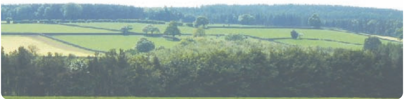
B Looking south west from Green Lane top.