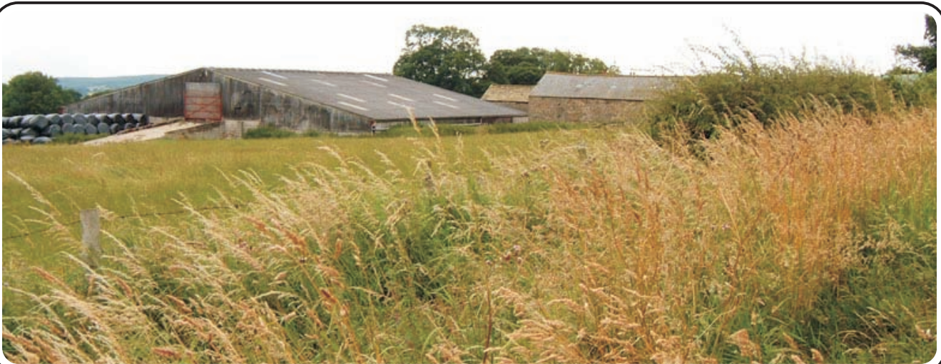
B Modern farm buildings viewed from Cote Lane.