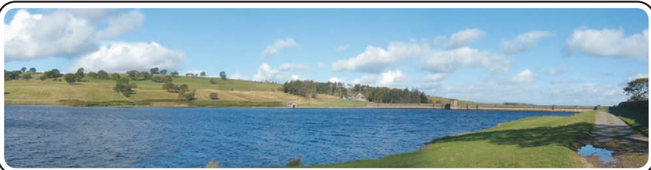
B Roundhill Reservoir looking down the valley.