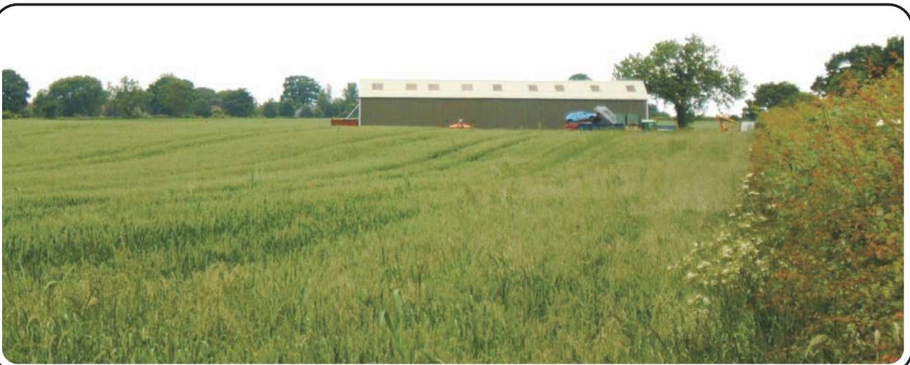
B A modern farm building off Light Mire Lane.