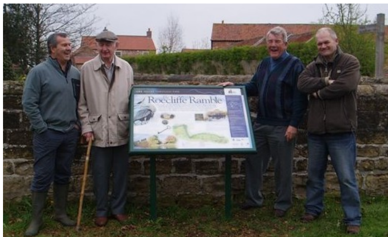
From left to right - Some members of Ure Walks Through Time Project Group.

"They often say that those who know least about their area are the locals. Not really true in the Boroughbridge area where we are proud of our history and visitor offer. But we want to open up everyone's eyes so that they can see for themselves what a wonderful area this is to live and work in, or to visit for the day or stay as part of a tour of Yorkshire. Two thousand years of history are to be found in Aldborough and Boroughbridge. Most people just thunder by on the successor to the Great North Road – the A1 – but we want them to call in and stay a while and enjoy our tranquil surroundings."