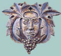
Bronze Green Lady