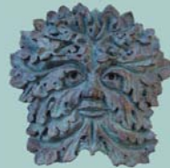
Dark Green Man