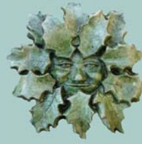
Holly Leaf Green Man