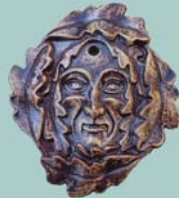
Leaf Green Man