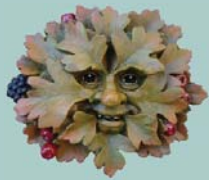
Autumn Green Man