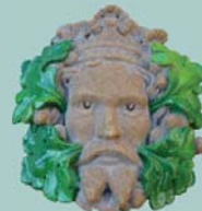
Green Man King