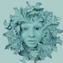
Dark Green Lady

For further information about the Friends Group please contact