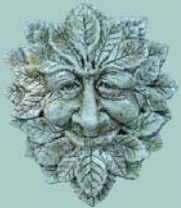
Happy Green Man