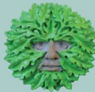
Bright Oak Green Man