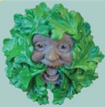
Green Man spirit

Here are some examples of the faces you will find