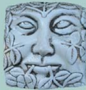
Square Green Man