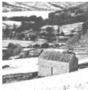
Nidderdale AONB in winter

The Local Plan was adopted in February 2001. Policies relevant to landscape conservation and development are found throughout the Plan, since landscape matters are integrated into all aspects. (For planning policy see Sheet LDG 1.3)