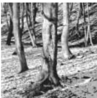
Woodland above Pateley Bridge

Our environment is subject to conflicting demands for housing, industry and commerce, transport, water, energy and food production; yet we value it for its wildlife, scenic beauty and historic interest.