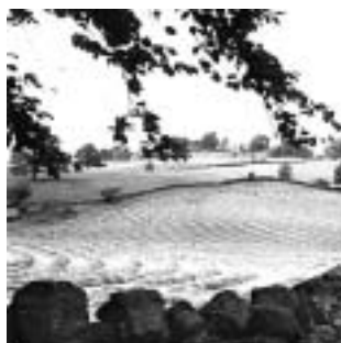
Haymaking at Middlesmoor