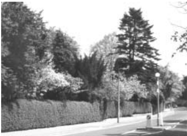
A suburban street with mature tree mix

This advice has been developed through consultation with the public and is available as Supplementary Planning Guidance, to be read in conjunction with the Harrogate District Local Plan.