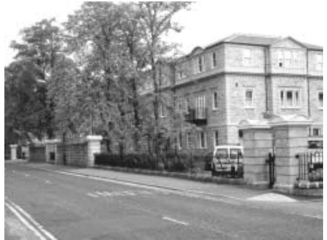
Queens Court - a recent office/residential development retaining mature trees.

Harrogate Borough Council is committed to a strategy for the protection and enhancement of the special character and environment of Harrogate District.