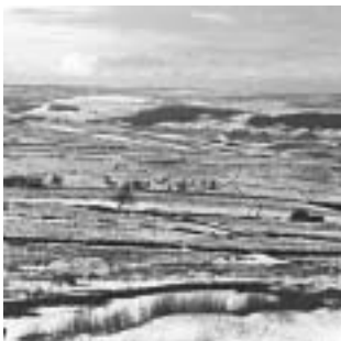
Nidderdale AONB in winter

Our landscape is a complex combination of physical and cultural elements which have evolved through a long process of people working with the land to create places with identity. The landscape is continually changing, but often may be fragile or vulnerable to damage through neglect or inappropriate development.