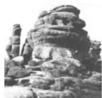
Brimham Rocks gritstone outcrops

Harrogate Borough Council guidance on other issues includes: