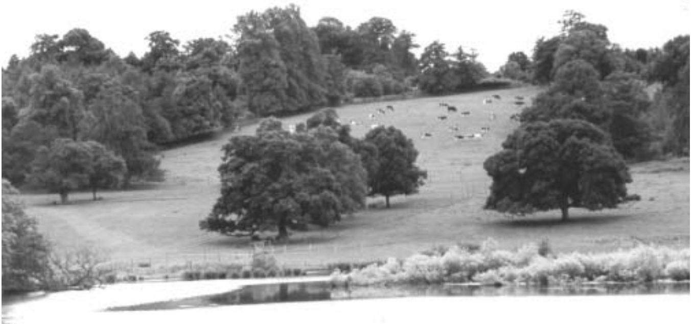
Ripley Castle parkland