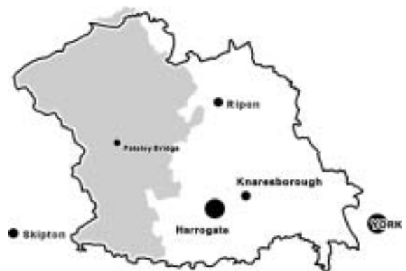
Nidderdale AONB takes up the western half of Harrogate District

Harrogate District Local Plan Policy C1 gives priority to the conservation of the natural beauty of the landscape. Applications for development which are likely to have a significant impact on this nationally important landscape are also scrutinised by the Nidderdale Joint Advisory Committee, an independent body with representatives from the principal groups within Nidderdale.